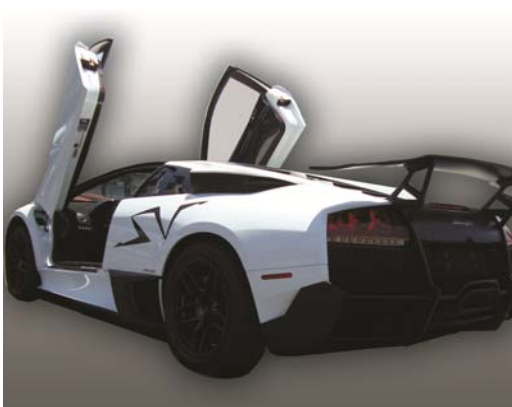
2010 LAMBORGHINI MURCIELAGO LP670-4 SUPER VELOCE

6.5L V12, 6 Speed Automatic Transmission w/ Manual Mode, OD, White Exterior, Black Interior, Automatic Climate Control, AM/FM/MP3, Navigation System, Power Steering, Power Locks, Power Windows, Aluminum Wheels, Odometer Reads: 298, VIN: ZHWBU8AHXALA03837