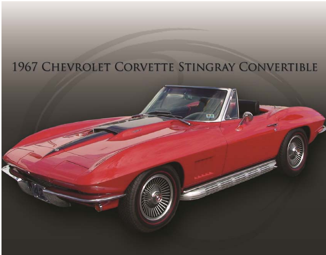
1967 CHEVROLET CORVETTE STINGRAY CONVERTIBLE