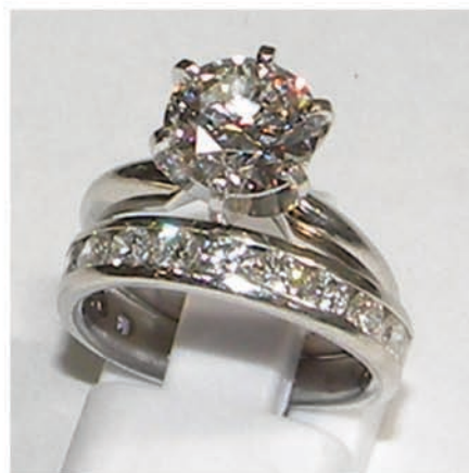
Electronics and Jewelry featured in the next auction on June 9, 2010 in Riverside, CA