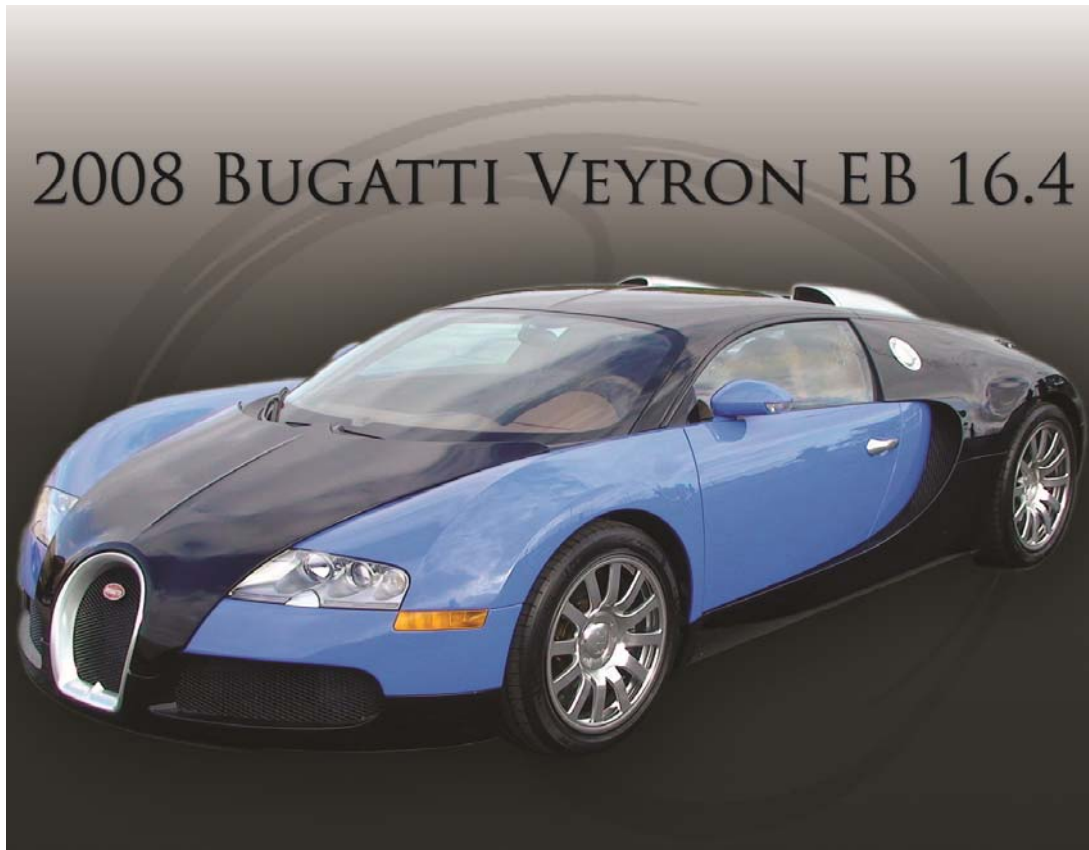
2008 BUGATTI VEYRON EB 16.4

16 Cylinders, Quad Turbo Chargers, 7 Speed Transmission, Black/Blue Exterior, Tan Leather Interior, AM/FM/CD, Alloy Wheels, Odometer Reads: 801, VIN: VF9SA25C28M795153