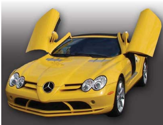
2008 MERCEDES-BENZ SLR MCLAREN CONVERTIBLE

V8, 5 Speed Transmission, Yellow Exterior, Black Leather Interior, AM/FM/CD Cassette, Power Seats, Power Windows, Power Locks, Air Conditioning, Alarm, Alloy Wheels, Odometer Reads: 692, VIN: WDDAK76F98M001788