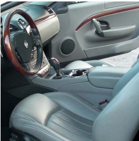
2009 MASERATI GRAN TURISMO COUPE

V8, Automatic Transmission, Blue Exterior, Gray Leather Interior, AM/FM/CD Player, GPS, Power Steering, Power Windows, Power Brakes, Power Locks, Air Conditioning, Alloy Wheels, Odometer Reads: 12,778, VIN: ZAMGJ45A090042326