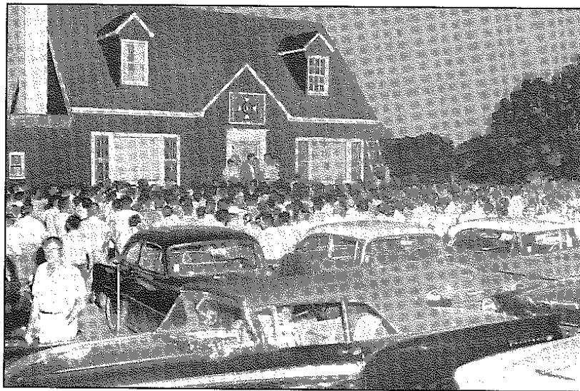
Turned into a mob by night.