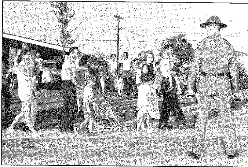
Protests during the day . . .

Appendix B: Crowds Gathering around the Myers House, August 1957 in The First Stone: A Memoir of the Racial Integration of Levittown, Pennsylvania (Chicago: Grounds for Growth press, 2004), 25.