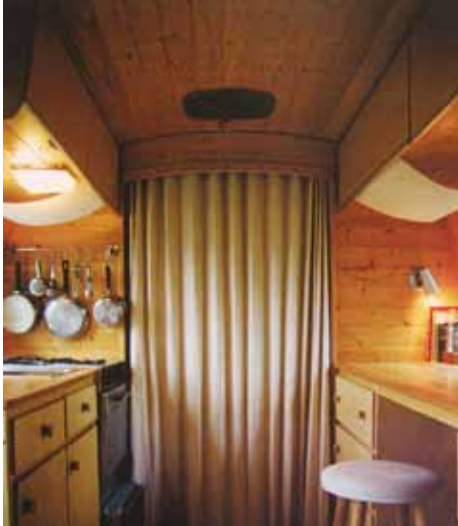
... and interior.