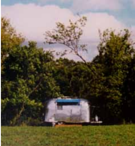
The Airstream's exterior...