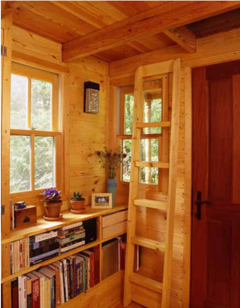
Tumbleweed's ladder (above), kitchen (opposite) and exterior (page 18)