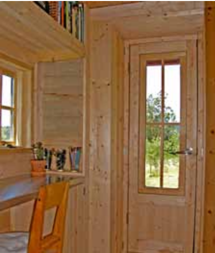
... and downstairs.

I called my next home XS-House (as in, “extra small”). It measured about 7’ x 10’. Like Tumbleweed, it was on wheels, it had a steep metal roof, classic proportions and a pine interior punctuated by a metal heater on its central axis. A bathroom, kitchen, and sleeping loft featured essentially the same utilities as my previous residence. Unlike Tumbleweed, there was a four-foot long, stainless steel desk and a couch, and the exterior walls were clad in corrugated steel.