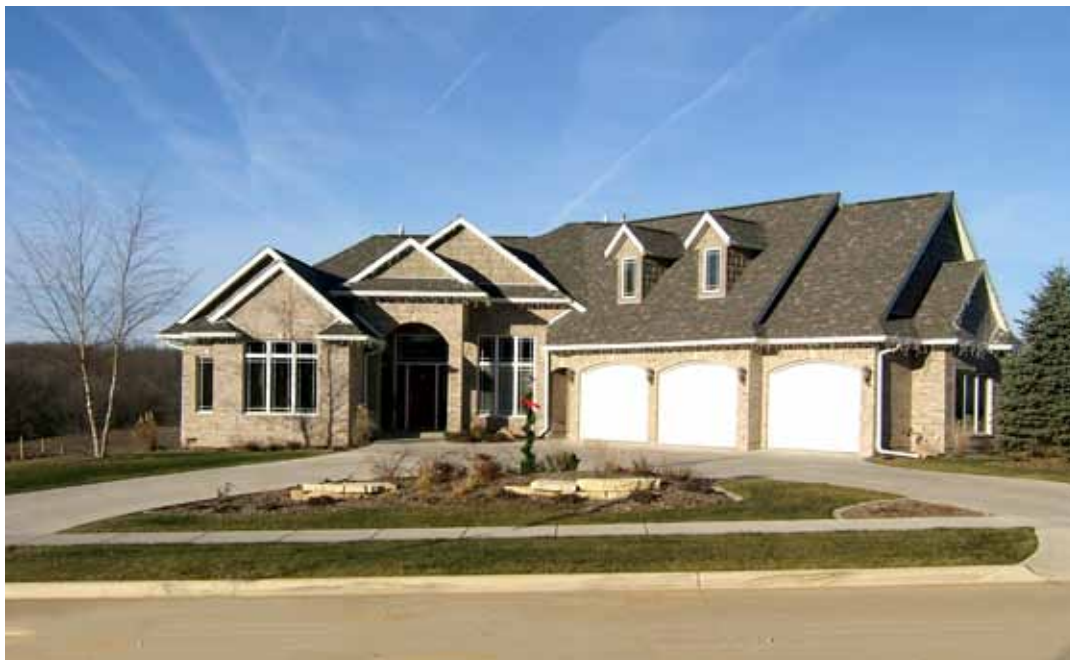
The “American Dream”

who may never arrive. It is not uncommon for a living room to go unused for months between social gatherings and, even then, quickly empty out as guests gravitate toward the informality of the kitchen.