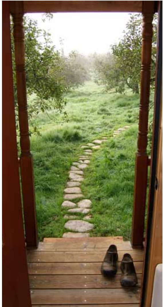
Tumbleweed 2 (above), Williamsburg, VA (next)

like anything else that is superfluous, extra space merely gets in the way of my contentment. I wanted a place that would maintain my serene lifestyle, not a place that I would spend the rest of my life maintaining. I find nothing demanding about Tumbleweed. Everything is within arm's reach and nothing is in the way—not even space itself.