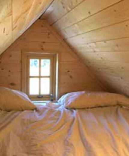
XS exterior (page 19), loft (above)...