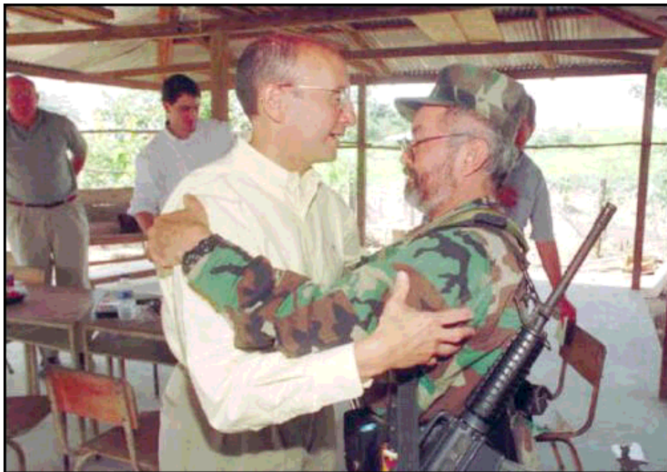
NYSE Chairman Richard Grasso with a FARC Commmander

When you think about it, this analysis make sense. The folks with the BIG PERCENT -- big cash margin -- would end up rich and in power and the guys working their you-know-what off for SLIM PERCENT -- a low cash margin -- would end up working for them.