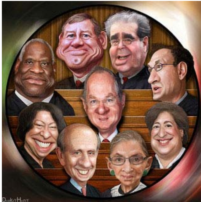
Photo Illustration by DonkeyHotey via Flickr/Special to The Politics Blog

http://www.esquire.com/blogs/politics/supreme-court-approval-rating-8534367