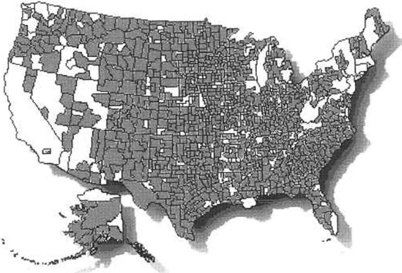
FIGURE 1: MAP OF ELECTRIC CO-OP SERVICE AREAS 6

Figure 1 Note: The shaded areas of the map are served exclusively by electric co-ops.