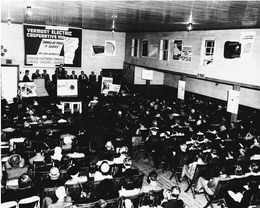
FIGURE 2: ANNUAL MEETING OF VERMONT CO-OP IN 1949 99

As the decades passed, attendance at annual meetings fell because members started taking electricity for granted, even wasting power that had once been considered precious. 100 No one wanted to discuss co-op financial statements anymore. Co-op managers were busy maintaining existing power lines instead of building new ones. 101 They boosted sales by increasing customer density and by promoting appliances. They focused on higher co-op revenues, not lower member bills. Even the legal mandate for co-operative education dwindled into an automatic subscription to a co-op magazine with massive circulation, but barely a mention of co-op mechanics. 102 Today, co-